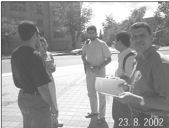
Muslim students on Queen's main campus

The uncontested reign of individualism is also reflected in the values promoted by student councils and governments. All lifestyles, especially those furthest from religion, are promoted. Illicit, unlimited sex is seen as something to be sought and a basis for building a macho reputation (as long you can avoid