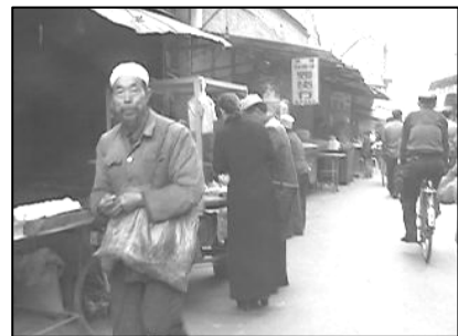
A Muslim man in Xian's Muslim food street.

How many Muslims are there in China? Really, how many of us know anything at all about approximately 20 million of our brothers and sisters in China? Not much. In fact I was surprised at the population after an article on Chinese Muslims was posted on QUSMANet. So I thought I would try to find out more about them and this is what I found.